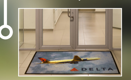
WaterHog Impressions HD®