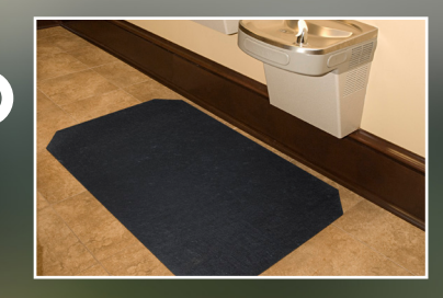
Sure Stride<sup>®</sup> (Adhesive-Back Matting)