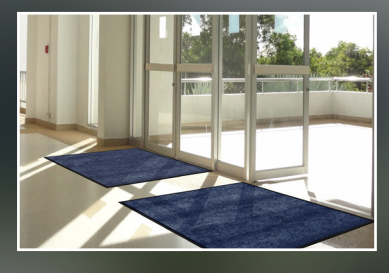
ColorStar <sup>®</sup> (PET fabric features 100% recycled content reclaimed from plastics)

By preventing contaminants from entering a facility, mats will substantially reduce the need for cleaning chemicals that might be harmful to building occupants and the environment. M+A is committed to developing and manufacturing eco-friendly products, reusing and recycling materials as often as possible.